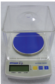
KK200 with breeze break